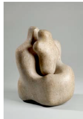
Barbara Hepworth, Mother and Child, 1934.

Whilst some pupils responded well to the prescriptive approach to their art activities, many Year 9 pupils seemed quite disengaged. I wanted pupils to experience something quite different, with opportunities to experiment with ideas, materials and scale, problem-solve, make connections between artists work and their own, have conversations, make decisions, try something different, work collaboratively and develop their work in a more organic way. Having observed the engaged way in which pupils behaved in the dance lessons, I wanted to introduce the same sense of freedom to the art lessons, where pupils were able to move around, find their own space, sit, lie or stand and respond to the space they are in, as opposed to sitting side by side at a desk drawing on A4 or A3 paper.