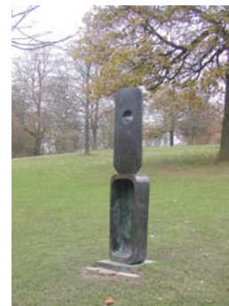
Barbara Hepworth, Family of Man , 1970, Yorkshire Sculpture Park

Ami and Gillian had meetings with Learning staff at YSP in advance of the visit to plan the session, route, activities and select appropriate artworks. A set of resource packs were then prepared for pupils with images, art materials and pick'n'mix activity cards for them to respond to in sketchbooks, which included generic activities to encourage observation, emotional response, develop vocabulary, etc. Unfortunately due to heavy snow, the gallery visit had to be cancelled, although it is hoped that the trip will be rescheduled for a later date. Pupils were going to document the visit through photography and evaluate the effectiveness of the resources in the next session. Instead, Janet ran an alternative session in school, where pupils used pictures of sculptures to respond to activity questions where possible. They also made life drawings using one another as models, which Janet said "were much more successful thanks to the process they'd been through the previous week."