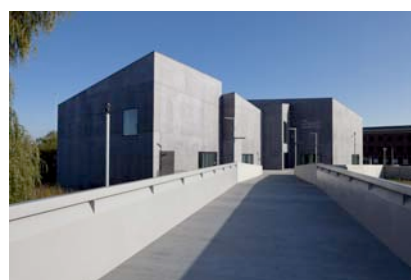
The Hepworth Wakefield